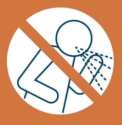
Don't handle food if sick