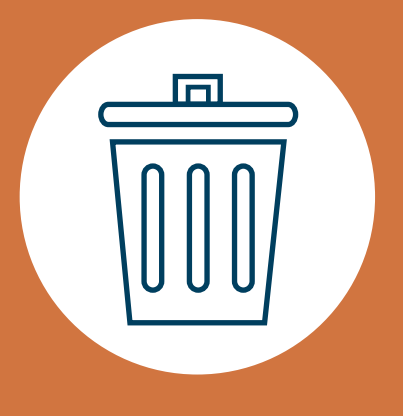
Throw out rubbish